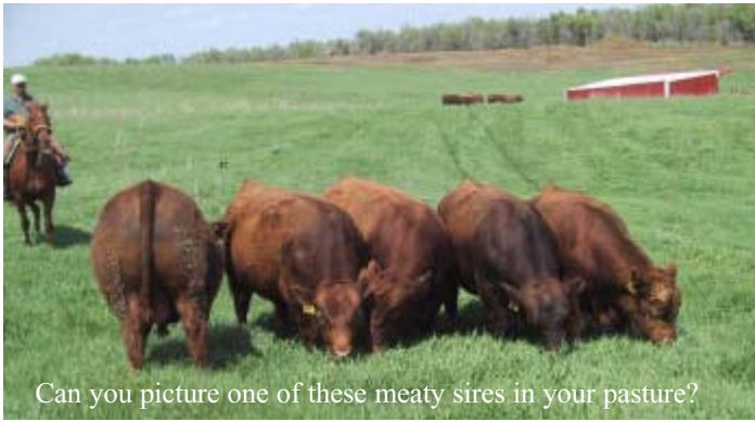
Can you picture one of these meaty sires in your pasture?